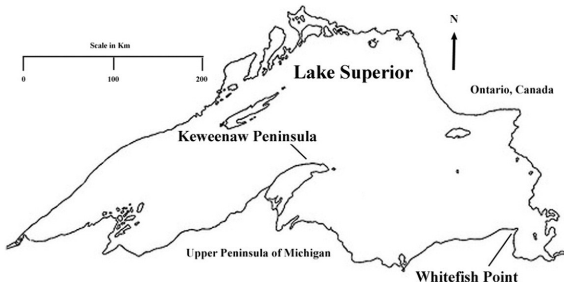
Fig. 1. Map of Lake Superior and survey sites at Keweenaw Peninsula and Whitefish Point, Michigan.

Nearly every species that was abundant at both locations was far more abundant at WP compared to KP, consistent with our fall funneling hypothesis that proposes that birds accumulate from northern and northwestern to southeastern Lake Superior. However, even when only considering positively identified individuals, the pattern of abundance